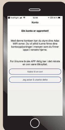
2. Install new heater