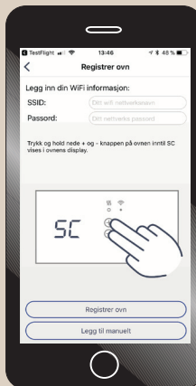
3. Enter your Wi-Fi SSID (network name) and push and hold + and - on your heater, when "SC" shows in the heater display, click "search for heater" in the app.

If you have several heaters – turn on one and one heater when installing them to the app.