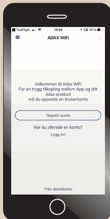
1. Download the "Adax Wifi" app and create user.

4 defined programs, add/edit week programs.